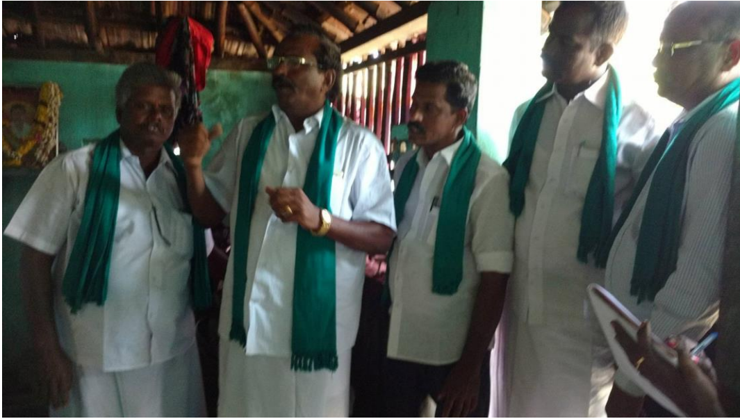
Representatives of Cauvery Farmers Association in Thiruvavur District